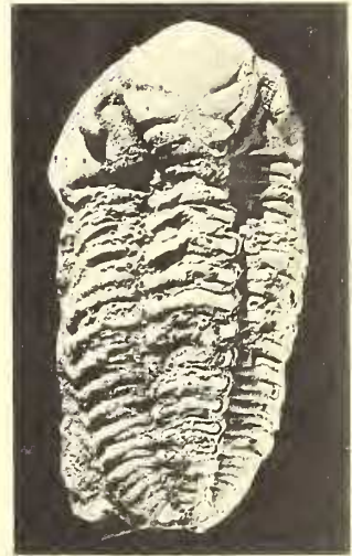
9 x 2.8